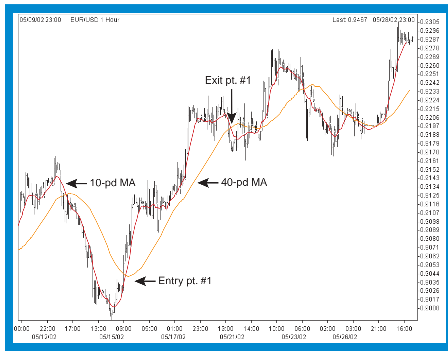
FIGURE 2: MOVING AVERAGE CROSSOVER SYSTEM. When the shorter-period moving average crosses above the longer-period moving average, consider it a signal to enter a long position. When the short-period MA crosses below the longer one, consider it to be an exit point.

These examples show the use of one indicator or technical analysis tool to make trading decisions. Often, you may have to use more than one. The chart of the euro in Figure 3 displays the use of multiple technical indicators as confirming signals. There, you see a divergence between price movement and the movement of the relative