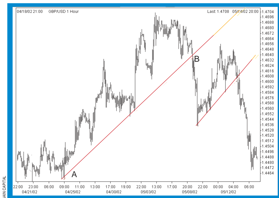
FIGURE 1: SIMPLE TRENDLINE. This hourly GDP chart shows an excellent opportunity to enter a short position on a trendline break of a previously strong upward trend.

Further, approximately 85% of all daily forex transactions involve “the majors,” which include the US dollar, yen, euro, British pound, Swiss franc, Canadian dollar, and Australian dollar. The depth and concentration of the market in just seven currencies provides a statistically significant dataset for trend analysis.