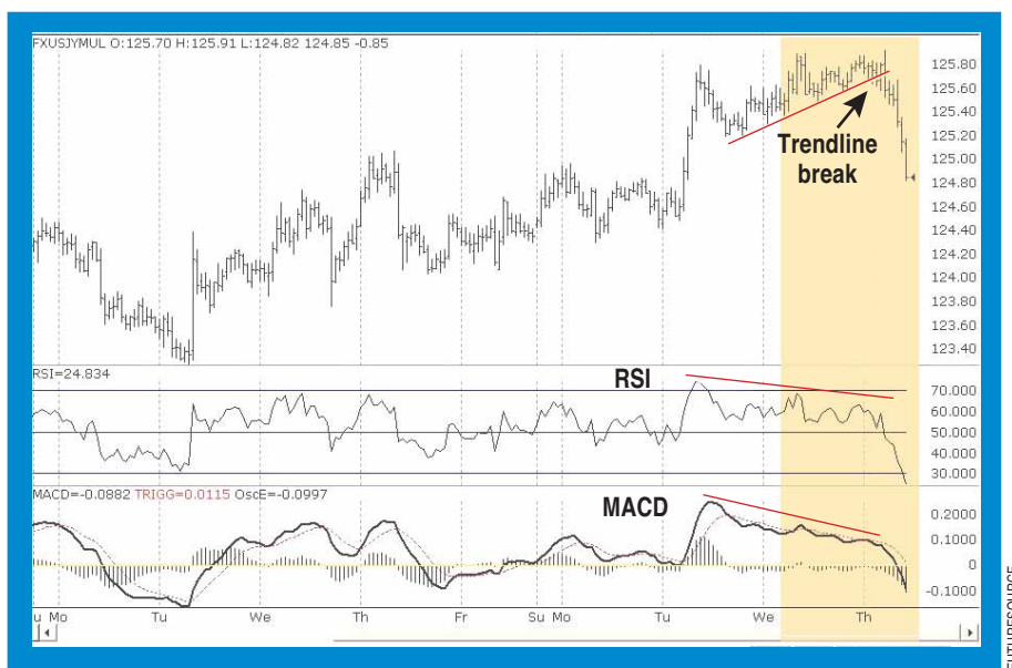
FIGURE 3: USING MULTIPLE INDICATORS FOR REVERSALS. When you see the diverging action of the RSI and MACD indicators, wait for the confirmation with the trendline break to enter a short position.

Since most currency trading is short-term in nature, speculators can cause erratic fluctuations in the exchange rates. You can see this in the 15-minute chart of the June 2002 Canadian dollar contract displayed in Figure 4. On June 3, 2002, due to the dismissal of the Canadian finance minister Paul Martin, short-term traders brought the value of the Canadian dollar down away from its long-run equilibrium point. But the value cannot move away from this point forever, and this can be seen by the quick revival of the exchange rate.