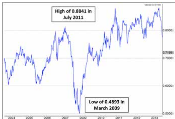
NZD/USD Monthly Chart