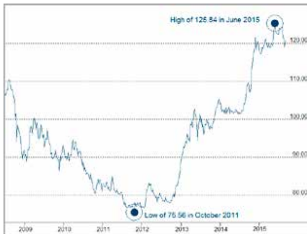
USD/JPY Monthly Chart