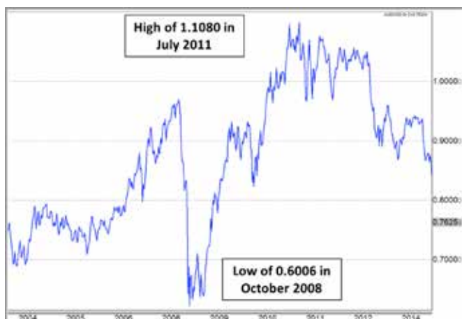
AUD/USD 10 Year Chart