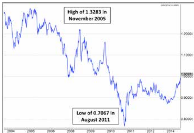
USD/CHF 10 Year Chart