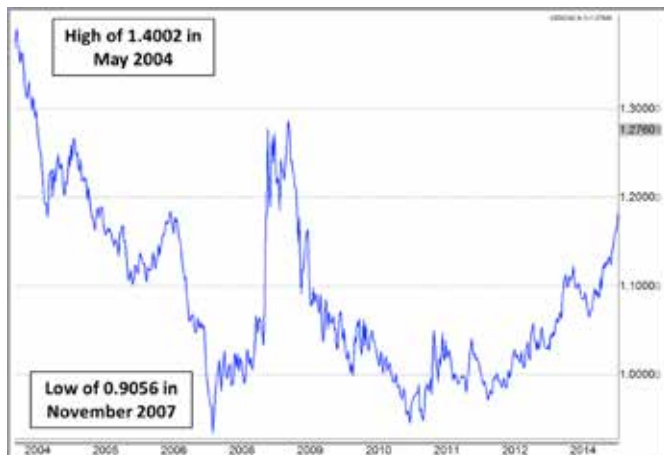
USD/CAD 10 Year Chart