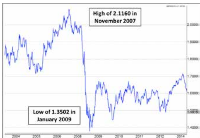
GBP/JPY 10 Year Chart