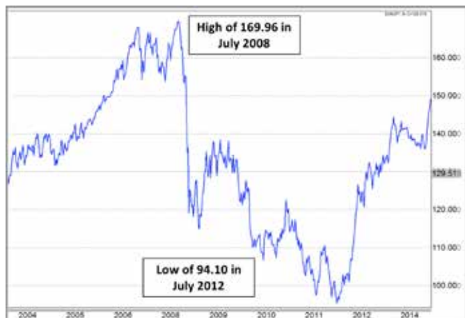
EUR/JPY 10 Year Chart